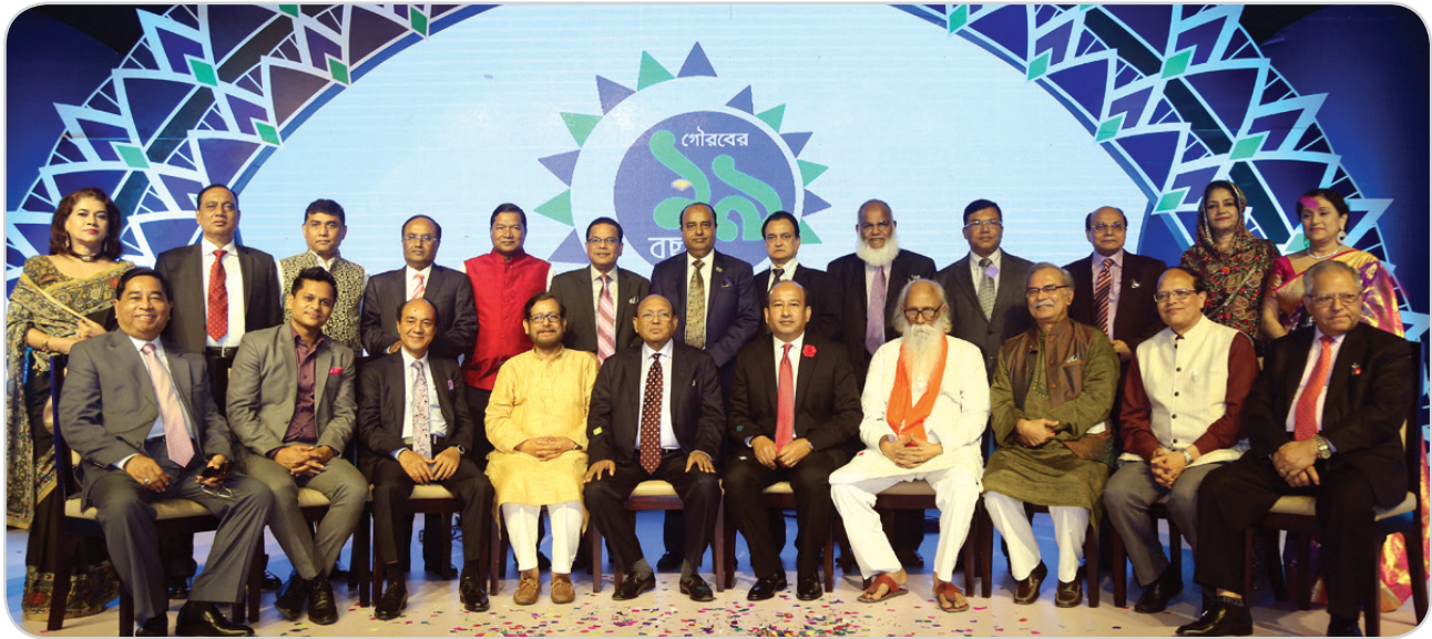
Recipients of Mercantile Bank Award-2018